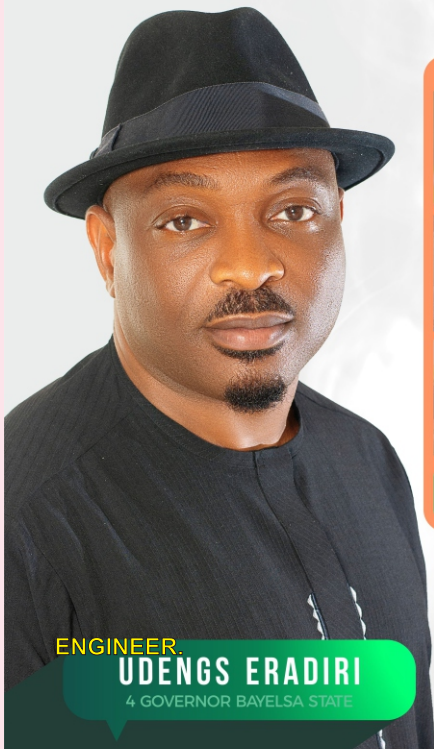
ENGINEER UDENGS ERADIRI 4 GOVERNOR BAYELSA STATE